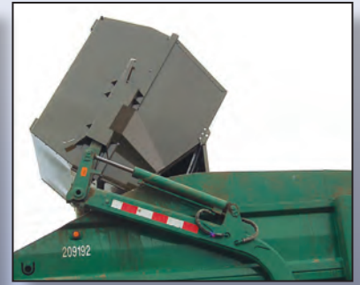
Auto release unloading door.

Galvanneal steel panels and stainless steel hinges ensure extended durability.