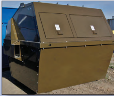
36" low loading height facilitates access for everyone.